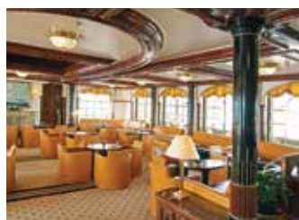
Owner's Suite (left) and Lounge (right)