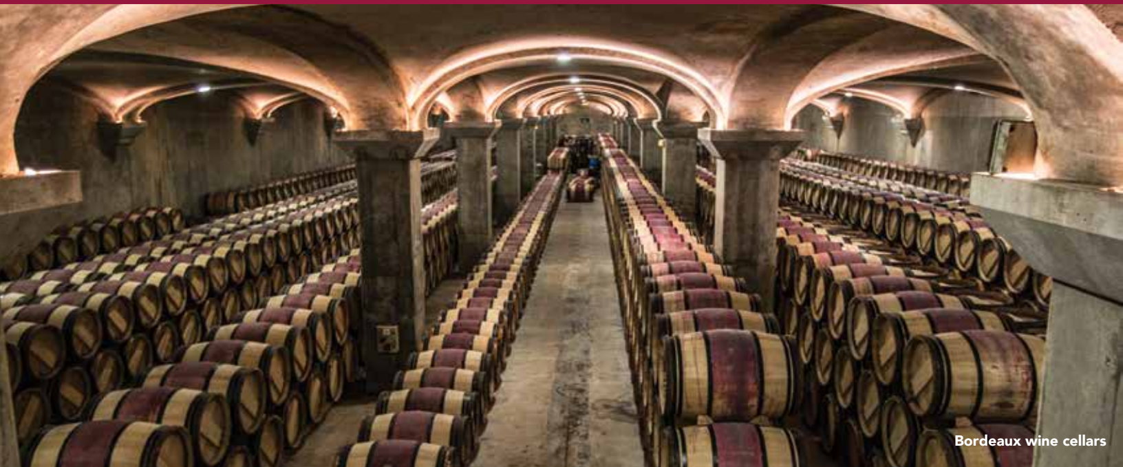
Bordeaux wine cellars