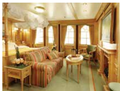
AmaDolce (left), Owner's Suite (right)