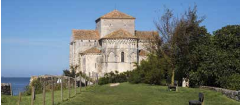
Eglise Sainte-Radegonde de Talmont church on the Gironde estuary

In charming Bergerac, visit the Récollets Cloisters to learn about the Dordogne’s 13 AOCs (official wine regions). See St. Jacques’ Church, originally built in the 12th century and a stop on the Camino de Santiago pilgrimage route. At the market, sample locally produced foie gras , walnuts, and truffles. B,L,D