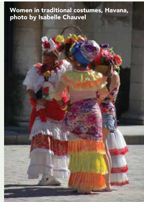
Women in traditional costumes, Havana

CONCLUDE with two days in Havana, meeting up-and-coming artists and performers at specially arranged events