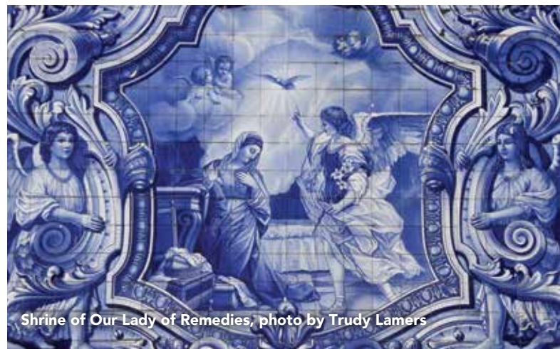
Shrine of Our Lady of Remedies

Spend the morning in Castelo Rodrigo, a fortified hilltop village overlooking slopes studded with almond trees and vineyards. Pass through its 16th-century walls, climb the narrow, medieval streets, and refresh with a tasting of regional wine and delicacies. A special private dinner is arranged this evening in Sabrosa at Quinta do Portal, a family-owned boutique winery with centuries-old vineyards. Tour its strikingly modern cellars, also designed by Álvaro Siza. B,L,D