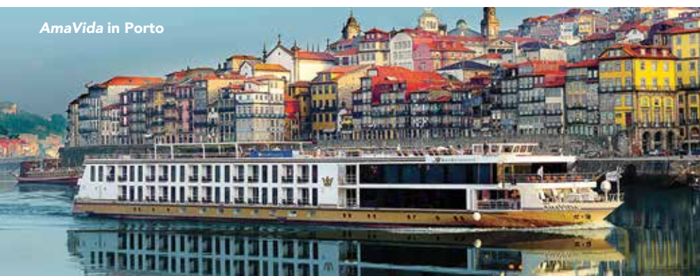
AmaVida in Porto

NOT INCLUDED IN RATES International airfare; passport fees; meals not specified; alcoholic beverages other than wine at lunches, dinners, and planned tastings; personal items and expenses; airport transfers for those not on suggested flights; trip insurance; optional Lisbon prelude or Santiago de Compostela postlude; any other items not specifically mentioned as included.